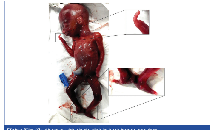
[Table/Fig-3]: Abortus with single digit in both hands and feet.

[Table/Fig-2]: Upper and lower limbs of the patient showing: a) Left hand with absent first, second and third digits and syndactyly of fourth and fifth digits and right hand with under-developed first digit and absent second and third digits. b) Left and right feet with median cleft.