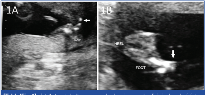
[Table/Fig-1]: (a) Antenatal ultrasonograph showing single digit in hand of fetus (horizontal arrow). (b) Antenatal ultrasonograph showing single digit in foot of fetus (vertical arrow).

A 27-year-old primigravida at 19-weeks of gestation came to gynaecology outpatient department of our hospital with an obstetric ultrasound showing presence of only one digit in the hands and feet of the fetus [Table/Fig-1a,b]. She had no exposure to any teratogenic drugs during the antenatal period. She also had congenital deformities in her limbs-absent first, second and third digits and syndactyly of fourth and fifth digits in the left hand and under-developed first digit and absent second and third digits in right hand. Both her feet had median cleft [Table/Fig-2(a,b)]. No other anomalies, which are commonly associated with the syndrome such as cleft lip/palate, hearing loss, mental retardation and eye, nasal, heart or urogenital defects, were present. There was no history of consanguineous marriage. Her husband was normal. Besides her sister, there were no other family members who suffered from the same deformity including her parents and grandparents. She wanted medical termination of pregnancy in view of the physical abnormalities in the fetus. The abortus was having similar malformations, with hands and feet as shown in [Table/Fig-3].